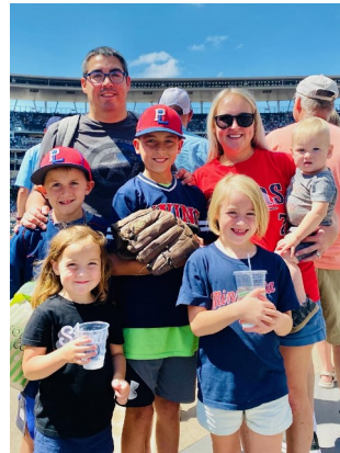
The Sargent Family