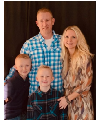
The Narum Family