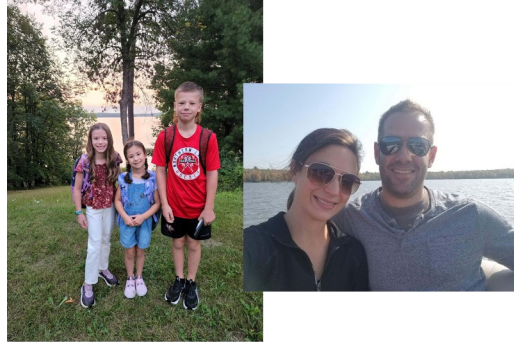
The Mileski Family