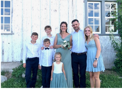
The Luzar Family